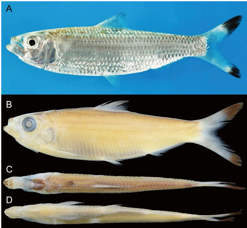
Figure 1. Specimen of Sardinella melanura , NSMT-P 145795, 66.0 mm standard length, Kashima City, Ibaraki Pref., Japan [(A) lateral view of fresh specimen; (B) lateral, (C) dorsal, and (D) ventral views of preserved specimen).

Bay, Kagoshima Prefecture]; Hirata et al. 2010: 21 (Murote, Ainan Town, Ehime Prefecture); Hata and Motomura 2011: 57, fig. 8 (Uchinoura Bay, Kimotsuki Town, Kagoshima Prefecture); Torii et al. 2011: 123, table 3 (estuaries of Bumi-gawa and Oku-gawa rivers, Okinawa-jima Island, Okinawa Islands); Aonuma and Yagishita 2013: 299, unnumbered fig. [Ogasawara Islands, Wakayama Prefecture (Kushimoto Town), Miyazaki Prefecture, Kagoshima Prefecture (Akime, Ibusuki, and Uchinoura Bay), and Ryukyu Archipelago (Tokuno-shima and Iriomote-jima islands)]; Suda et al. 2014: 5 (Fukiage-hama Beach, Kagoshima Prefecture); Sasaki et al. 2014: 16, table 1 (Miyano-hama Beach, Chichi-jima Island, Ogasawara Islands); Yoshigou 2014: 48 [Tokuno-shima Island (Amami Islands), Okinawa-jima Island (Okinawa Islands), Miyako-jima Island (Miyako Islands), Ishigaki-jima and Iriomote-jima islands (Yaeyama Islands), Ryukyu Archipelago]; Ikeda and Nakabo 2015: 300, figs. 1–3 in pl. 43 [Minabe Town (Iwashiro) and